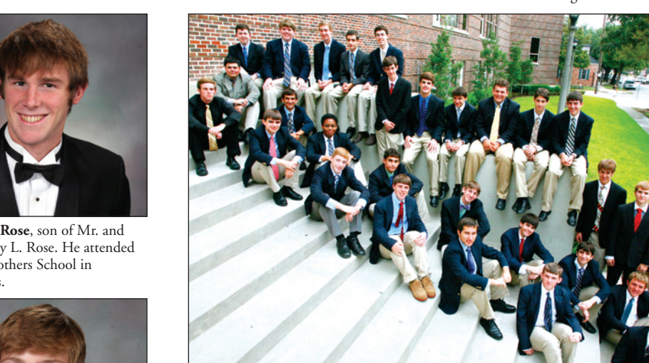
The 28 National Merit Semifinalists of Jesuit High School's Class of 2011