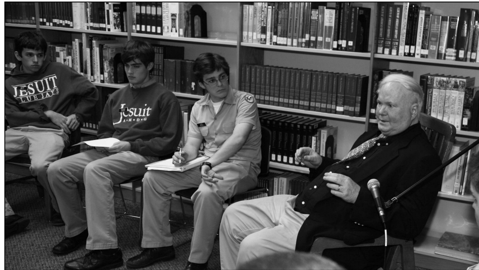
Author Pat Conroy discusses the art of writing with a group of creative writing students in the Resource Center during a visit to Jesuit High School in April of 2008. As part of the Visiting Author program, Conroy, who died this month, also addressed the full student body. At right, he donned a Blue Jay cap as a memento of the occasion.

With a blend of humor and sentiment, laughter and tears, Conroy shared the writer's life with his students going beyond concepts of literary theory. With his trademark affectionate growl, he told "you good Jesuit boys" the back stories that would be shaped into his books. His harsh life and relationship with his father would be told in "The Great Santini," his breakthrough novel. His experience as a cadet at The Citadel became "The Lords of Discipline." And in the